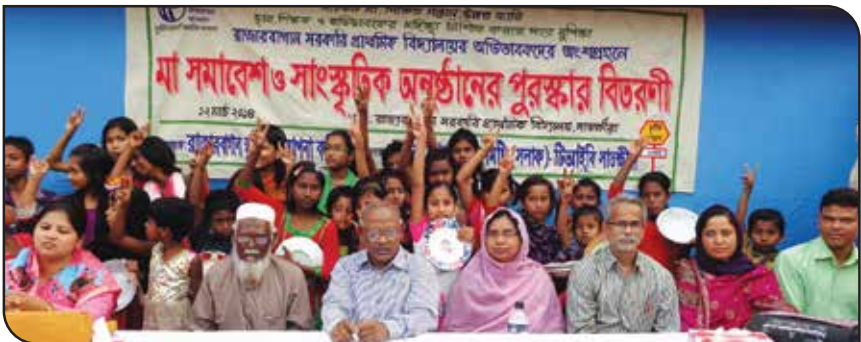
Participants of Mother's Gathering

TIB's activities are implemented at two levels - national and local - through processes of civic engagement, research and advocacy. At the national level its work is designed to bring the issue of corruption into sharper focus of public discourse and contribute to the strengthening the pillars of democracy and National Integrity System.