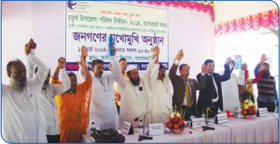
Face the Public - another social accountability tool of TIB

TIB's new project 'Building Integrity Blocks for Effective Change-BIBEC' (October 2015- September 2019) concentrates on building and strengthening a series of mutually supportive and reinforcing integrity blocks to effectively reduce corruption. 'Blocks' here imply the key institutions, policy/law, education, training, ethics