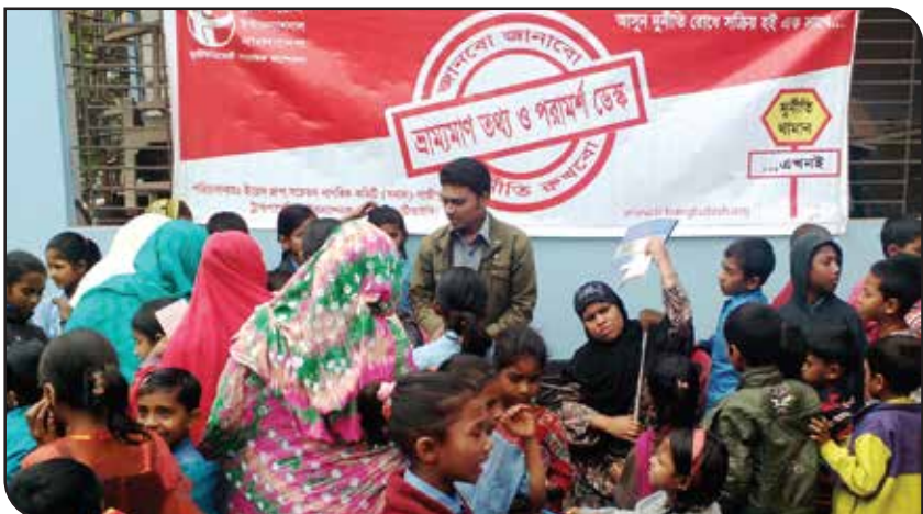
YES members helping patients through AI-Desk at Hospital premises