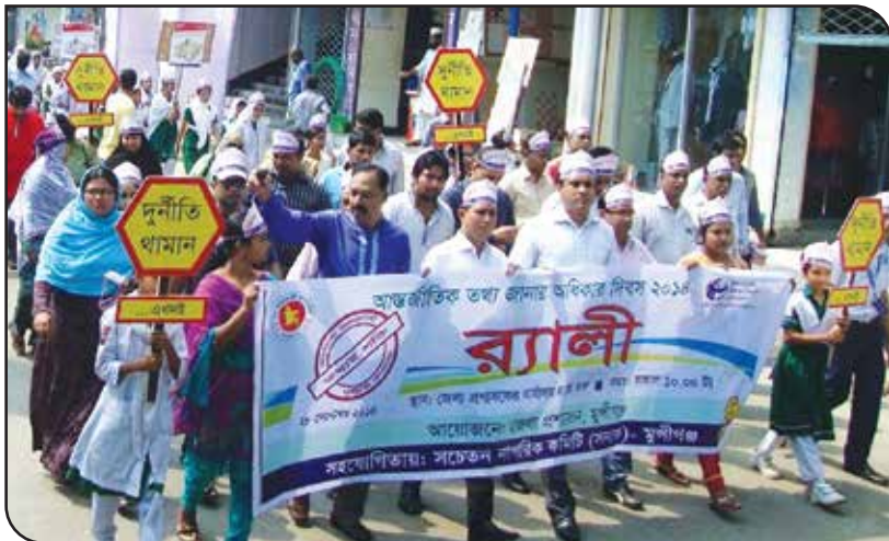
CCC Munshiganj brought out a rally to mark International Right to Know day 2014