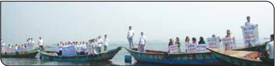
Human chain organised by CCC to stop pollution of the river