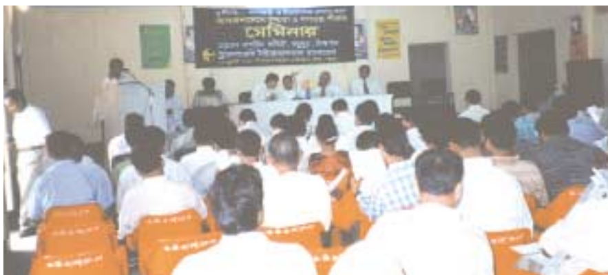
Modhupur CCC organised a seminar at Upazila Training and Development Centre