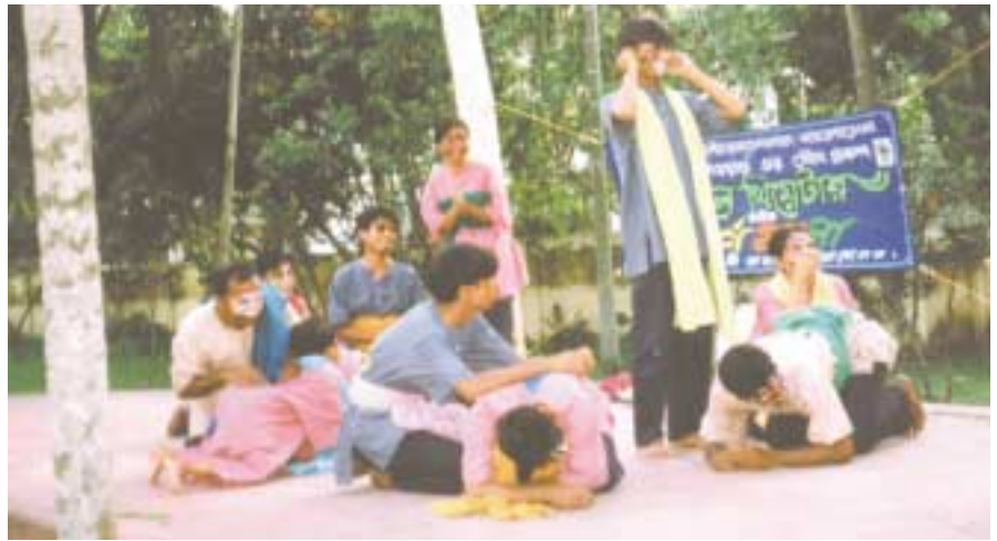
Mobile theatre show staged