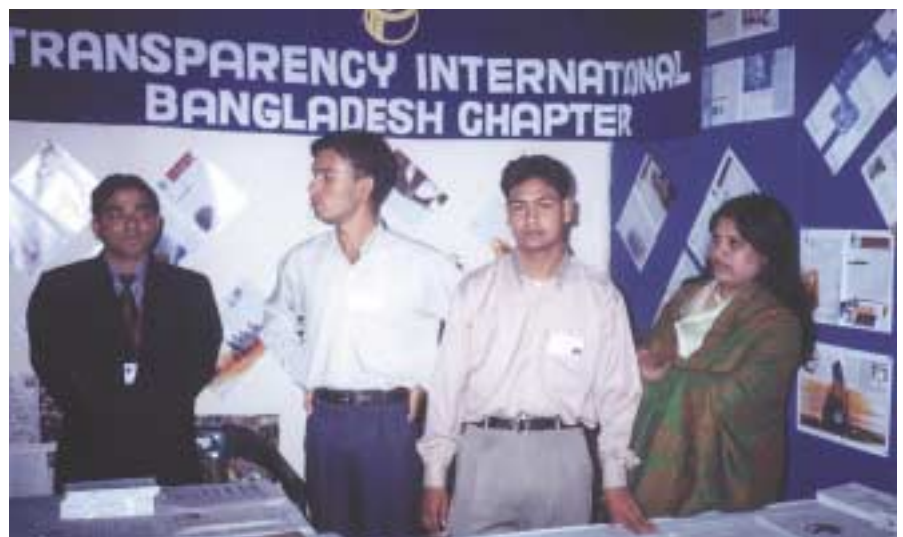
TIB stall at the 'Democracy Festival' held in Chittagong

TIB and Kishoreganj CCC organized an anti-corruption essay and debate competi-