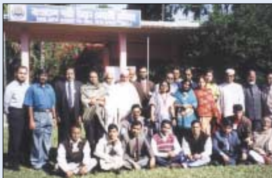
CCC Participants attending advocacy training in Comilla

Members of TIB's Committees of Concerned Citizens are frequently involved in advocacy work on different aspects of social life. An advocacy training was arranged recently to give them a clear idea about the issues on which TIB is campaigning. Twenty-four participants were present in the program held at