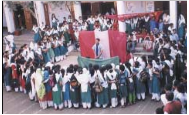
Mobile theatre show staged at Kishoreganj S. V. Government High School premises.

The People's Theatre Group also staged the anti-corruption play 'Bagher Gappo' at Nannibazar, Bankura Bazar and Muktijoddha Mancha of Nalitabari Upazila on 24 January 2002 in association with the Committee of Concerned Citizens of Nalitabari. There was a huge turnout at Nannibazar. Many witnessed the show even