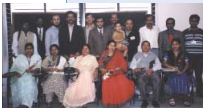
CCC Participants attending advocacy training in Borga

Headmasters of primary schools, Thana Education Officer, Assistant Education Officer, members of CCC and TIB officials were also present at the meeting held at the office of Dhanbari Teachers' Association.