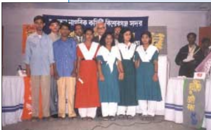
The finalists of a debate competition in Kishoreganj

An advocacy campaign on eliminating corruption in primary education was launched by TIB and CCC-Modhupur in Modhupur on 12 January 2002. Two separate meetings were held on the day at Modhupur Model Government Primary School and the office of Dhanbari Primary Teachers' Association.