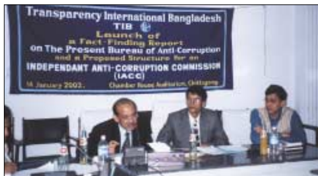
Discussion in Chittagong

Political goodwill is a prerequisite for curbing corruption. The Independent Anti-Corruption Commission must be free from political influences, but its accountability to the people must be ensured. This view was expressed by discussants at a meeting organized by TIB on the investigative report on the Bureau of Anti-Corruption and the