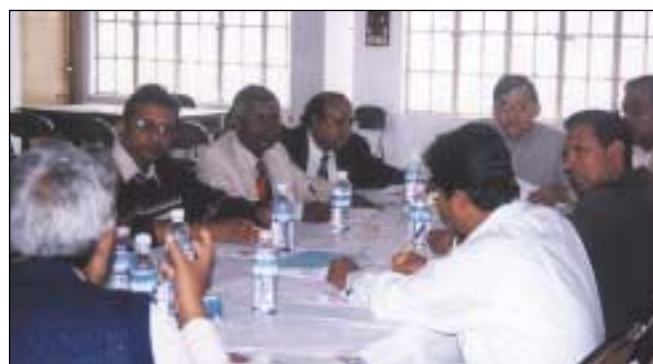
Focus group discussion in Rajshahi