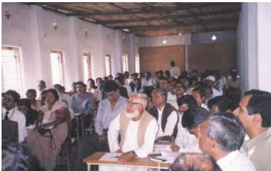
Discussion meeting with Education Officers and Headmasters of primary schools of Nalitabari, Sherpur