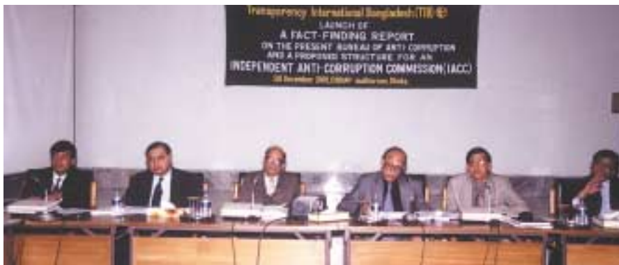
Launch of the Fact-Finding Report on the Bureau of Anti-Corruption and a working paper on an Independent Anti-Corruption Commission.